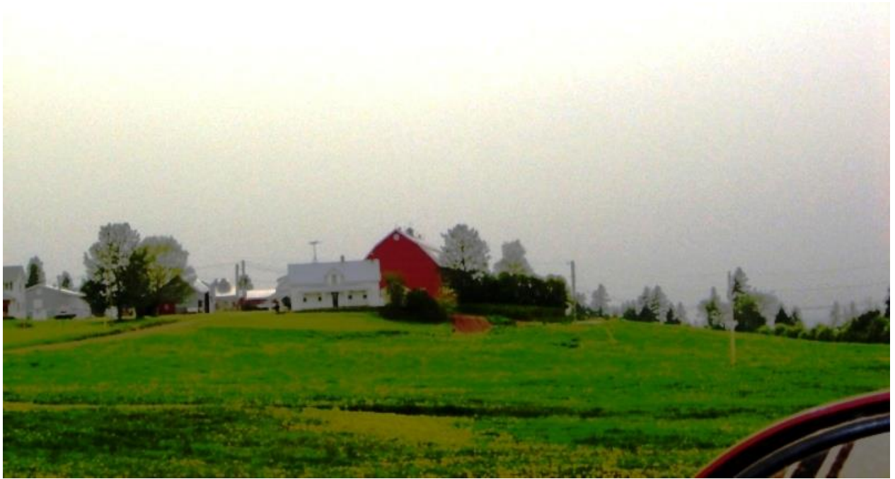
Sharp Homestead Lower Millstream, Kings Co., NB 200 years old Est 1785